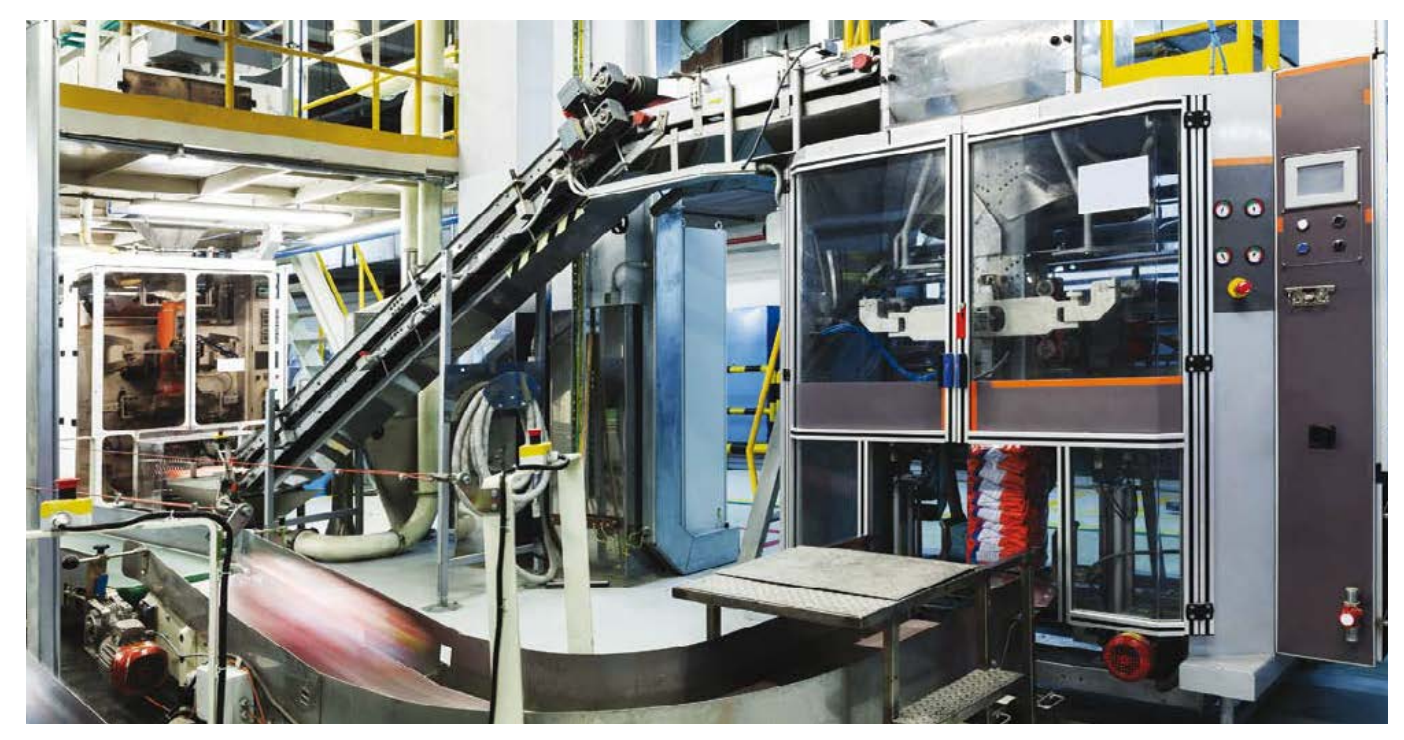
Optimized products for higher production output with less engineering efforts